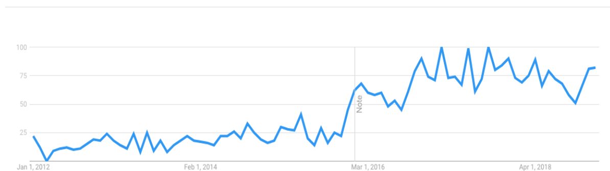
Graph 2.1. Level of interest for the term “women’s activewear” from January 2012 – January 2019

period. When a term is searched, the webpage provides a graph of interest between a designated timeline. The graph also provides a rating of the term 0-100 with 0 being of little interest, 50 medium interest and 100 of peak interest, as well as the correlating date. The term “women’s activewear” was searched with a custom time range set from January 2012 – January 2019. The following graph, Graph 2.1 Level of interest for the term “women’s activewear” from January 2012- 2019 was generated: