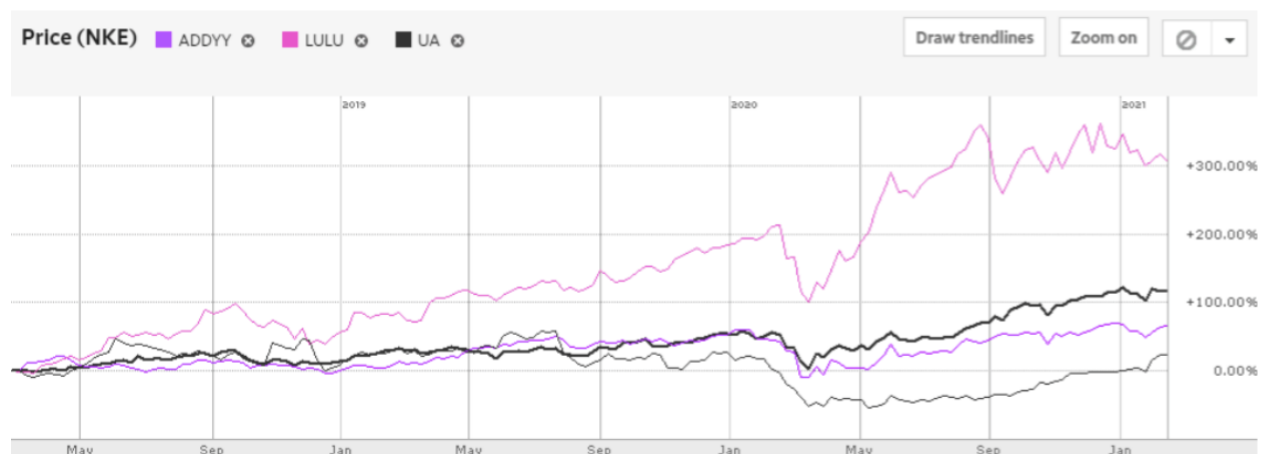
Graph 2.2. Lululemon growth rate 2018-2021