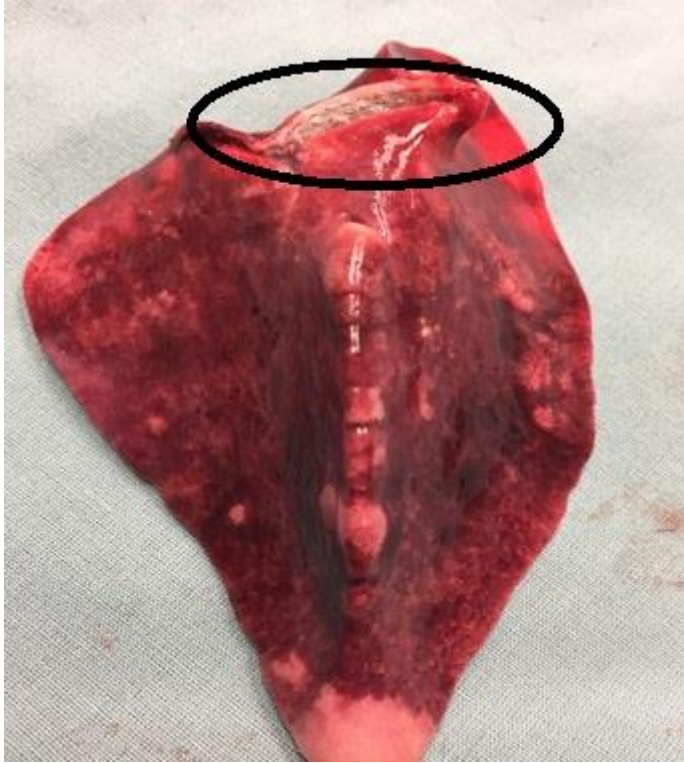
Figure 6. The three 2.0 mm staggered staple lines across hilum of the excised right middle lung lobe.