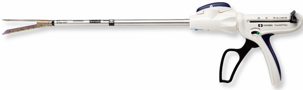
Figure 2. Endo GIA™ Ultra Universal Stapler.

No studies to date have recorded the normal size of bronchi or hilar vessels in a wide range of veterinary patients. Recommendations for staple sizes in canine lung surgery have been made largely based on successful use of certain cartridges in patients, but there is no objective data to suggest that the recommended sizes offer the greatest degree of occlusion of these structures.