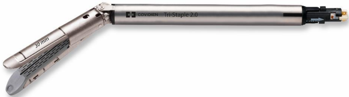
Figure 5. Articulating arm of the 2.0 mm Endo GIA™ stapler cartridge.