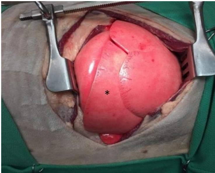
Figure 3. Right fifth intercostal thoracotomy with Finochietto rib retractor in place, for access to the right middle lung lobe (*). Cranial is to the left, dorsal is at the top of the image.

identified, and the stapler was deployed perpendicular to the hilus. Once the assigned procedure was finished, the thoracic cavity was filled with water. Positive pressure ventilation was utilized to hold pressure at 20 cm H 2 O for 5 minutes to mimic maximum physiologic airway pressure. Bruckner The submerged bronchus was assessed for air leakage as evidenced by gas bubbles within the fluid. Inability to maintain positive pressure at 20 cm H 2 O was also considered to be the result of air leakage from the lung. All procedures were performed by the same surgery resident in training.