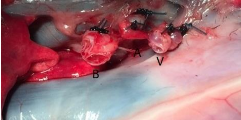
Figure 4. Suture ligation of bronchus (B), hilar artery (A), and vein (V), prior to oversewing bronchus. Cranial is to the left, dorsal is at the top of the image.