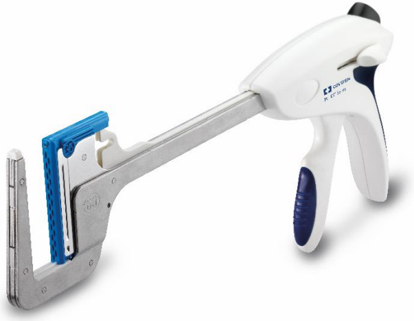
Figure 1. TA™ stapler.

TA™ staple cartridges come in 30 mm, 45 mm, 60 mm, and 90 mm lengths. 33 The 30 mm cartridge length is available with 2.5 mm (white V3 vascular cartridge), 3.5 mm (blue cartridge), or 4.8 mm staple heights (green cartridge). These staples compress to 1.0, 1.5, and 2.0 mm respectively. The 45 mm, 60 mm, and 90 mm cartridges are available with 3.5 mm or 4.8 mm staple heights.