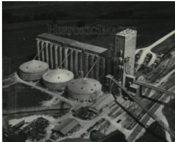
Figure 3. 1967 Press Photo of the Continental Grain Elevator in Westwego, Louisiana. Historic Images Part Number: nob04921.

bucket elevator system where, as Tim Duncan explains, “grain gets put into buckets bolted to a belt...with a conveyor running up. It elevates the grain vertically and discharges it onto distribution conveyors that then drop it into the silos.” 16 Evidence of this system is clearly shown in a 1967 press photo of the facility: the grain was carried from the river up the conveyor to the head house, where it was carried up in the bucket elevator, and then deposited for temporary storage. When the blast occurred, it triggered another in an adjacent area of the elevator and the structural support collapsed.