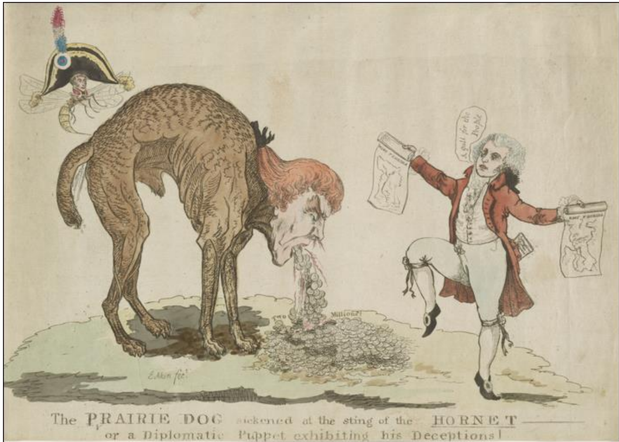
Figure 1. James Akin, “The Prairie Dog Sickened at the Sting of the Hornet,” 1806

In case anyone missed the point of the cartoon, the Federalist newspapers quickly published a satirical explanation that highlighted the new role of Bonaparte in directing American foreign policy. The cartoon was, the article insisted, was a “historical” piece of art and not a caricature—as suggested by some “ill-natured folks.” Indeed, said the article, it was such a masterpiece that it now hung in the halls of the Bonaparte’s Palace, where it was greatly enjoyed by the emperor himself. With great attention to historical detail, the article continued, the painting depicted Bonaparte administering a new purgative to a unique species of North American dog which caused him to “disgorge Two Millions of Dollars at the feet of a certain little Marquis.” The “dreadful operation” of this medicine was already well known in “Holland, Spain, Italy, and most parts of the Continent of Europe, by the name of the Napoleon physic.”