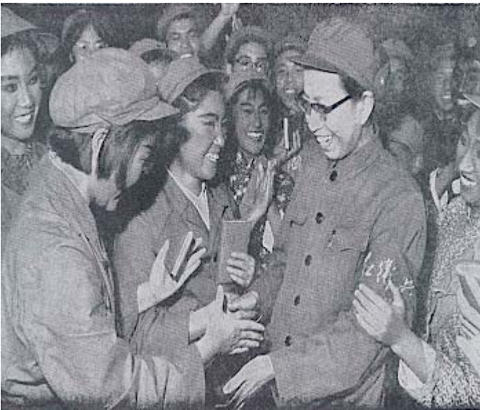
Figure 5: “Triumphs of Mao Tse-tung’s Thought in Literature and Art”, China Reconstructs , 1967 September, Page 9.

Red Lanterns, White Hair Woman, the Red Female Army, Harbors, Shajiabang, and Praise of Longjiang. The themes were the same: how Chinese women fight against the old system and enemy and how brave and fierce they were. For example, the Red Female Army told a story about how females oppressed by the old landlord got awaked and took up guns to fight against their enemy and got the victory. It went without saying that these female soldiers wore military green, which were also “Mao green”.