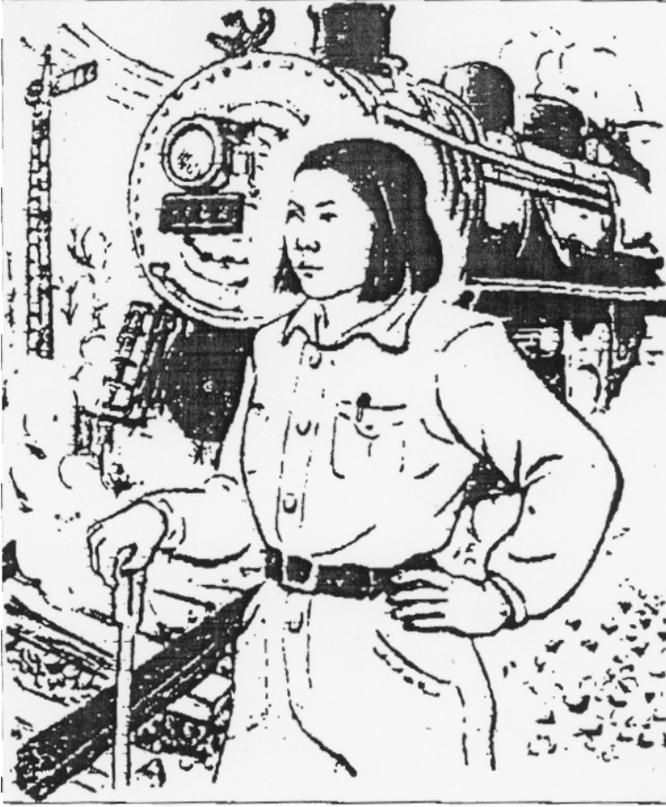
Figure 2: Tian Guiying, China's first female locomotive driver. Xin Zhongguo Funu ( New China's Women ). February 1956. p.1.

her for her exemplary work. In a pictorial representation of the story of Hao Jianxiu, she changed from her work clothes (a geometrically patterned cotton blouse under a white smock) into a belted Mao suit for attendance at a national model workers' convention. The storyline reached its climax at the moment Hao Jianxiu exchanged her smock, trousers, and blouse for a Mao suit; the text praised her role as a model of new China and her success in overturning attitudes of condescension to workers and women. Transformation of self and co-workers entailed promotion of Hao Jianxiu from feminine clothing and the particularized space of light industry to the purportedly universal realm of uniformity. Her new