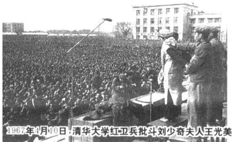
Figure 6: Wang Guangmei was interrogated at Qinghua University in April, 1967

According to your standpoint. Even though you are wearing a fur coat, you will also freeze to death. (Hinton, 1980)