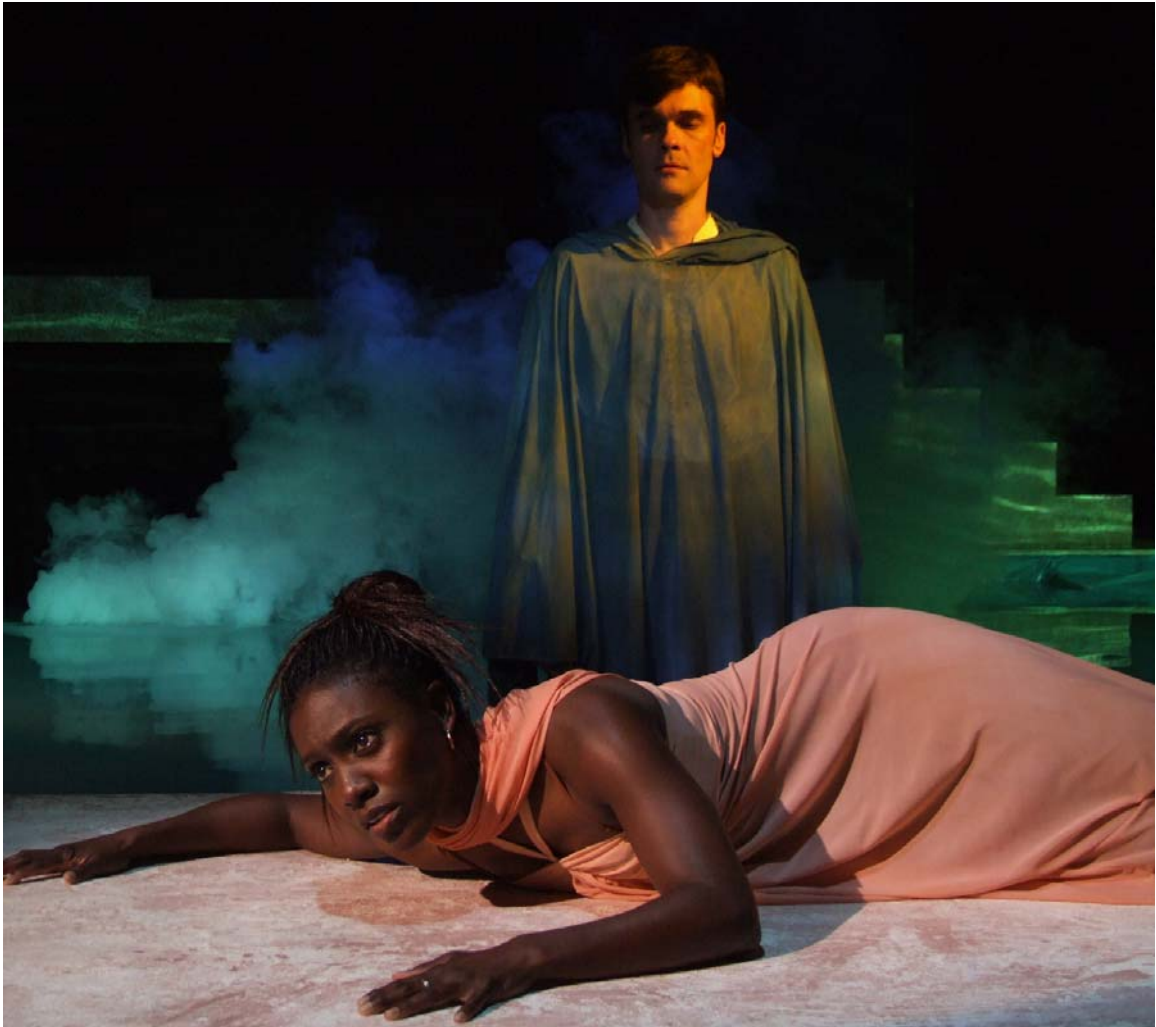
Production Photo: Morpheus-as-Ceyx and Alcyone