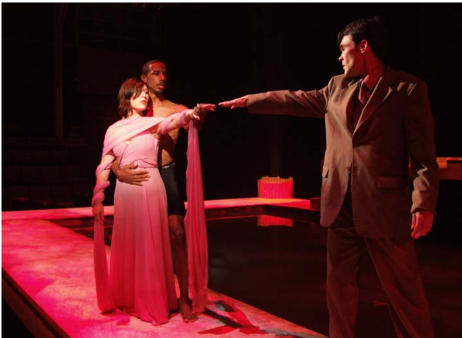
Production photo: Eurydice says “Farewell” to Orpheus before Hermes returns her to the Underworld