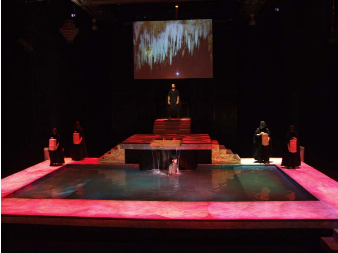
Production photo: Orpheus (center) pleads his case to Hades