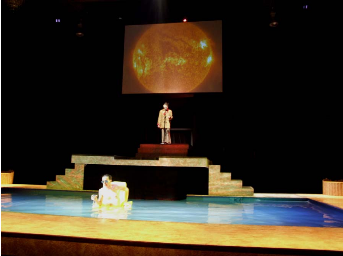
Production photo: Phaeton (lower left) tells his tale, while Apollo (center) scat-sings