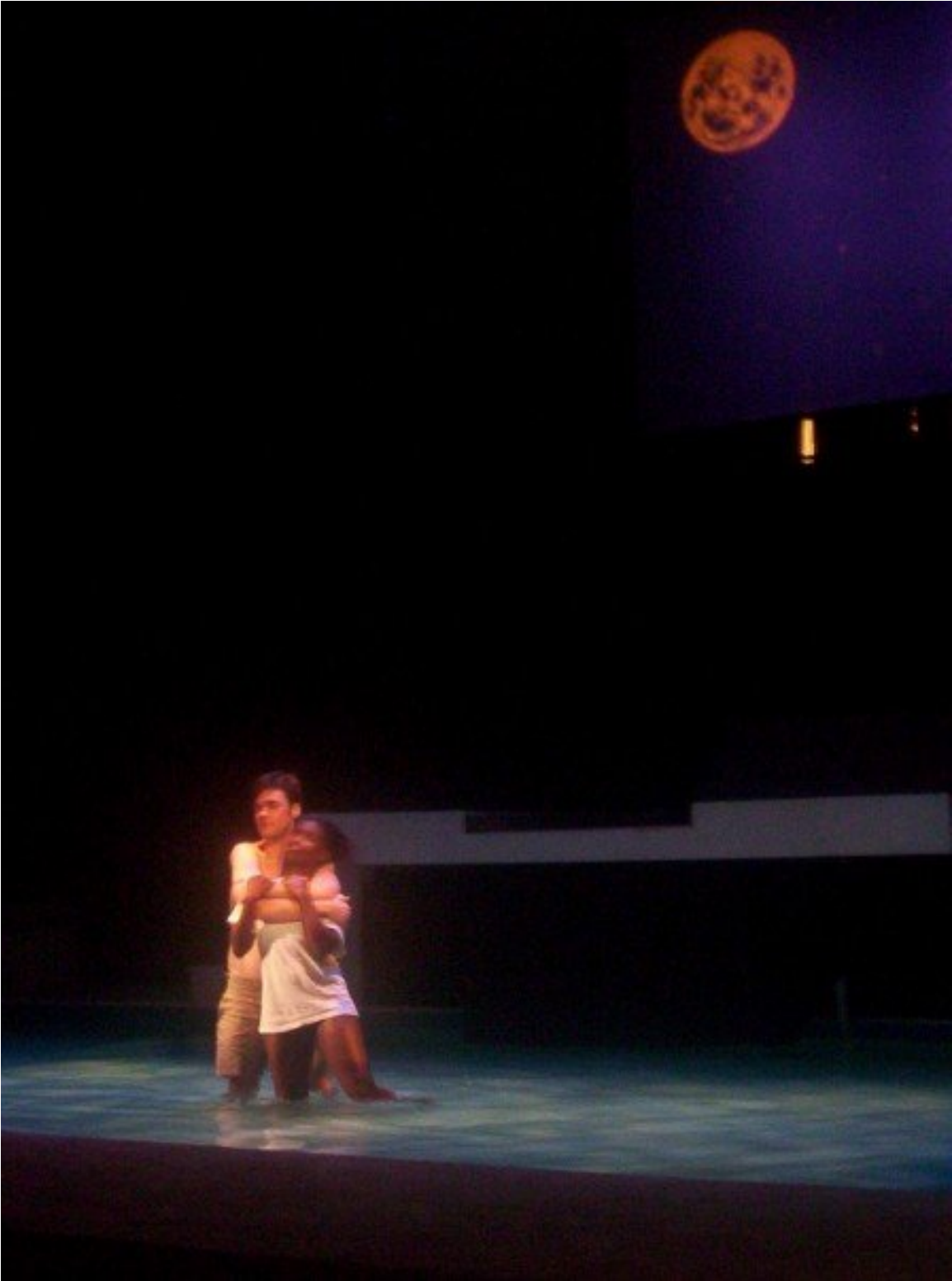
In rehearsal: Ceyx and Alcyone