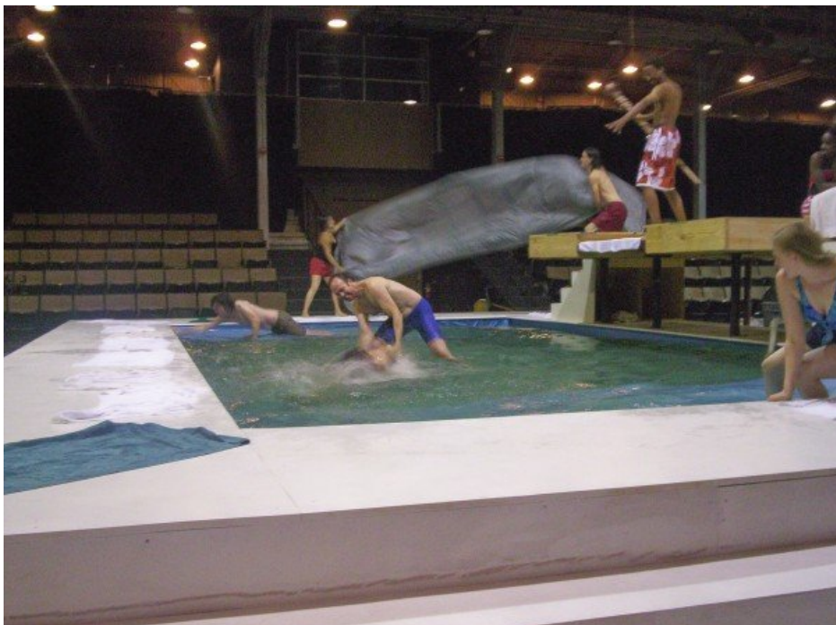
In rehearsal: The attack on Ceyx's ship