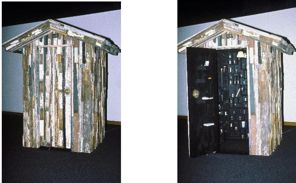
Figure 6. House of Trade

Inside the home is where most abuse takes place. For many who have survived sexual abuse, the body becomes a token of trade, bartered for temporary comfort and security, disguised behind a jaded veil called love. Victims are forced to create masks to display in the public arena. Similarly, most houses are well groomed on the outside and the inner-workings rarely discussed or put on display. By placing houses in the gallery, the private becomes public, yet remains private. The scale of each structure only allows for one or two people to enter at a time. The settings are intimate, where one is encouraged to engage in activities that reflect the ideas of barter and trade.