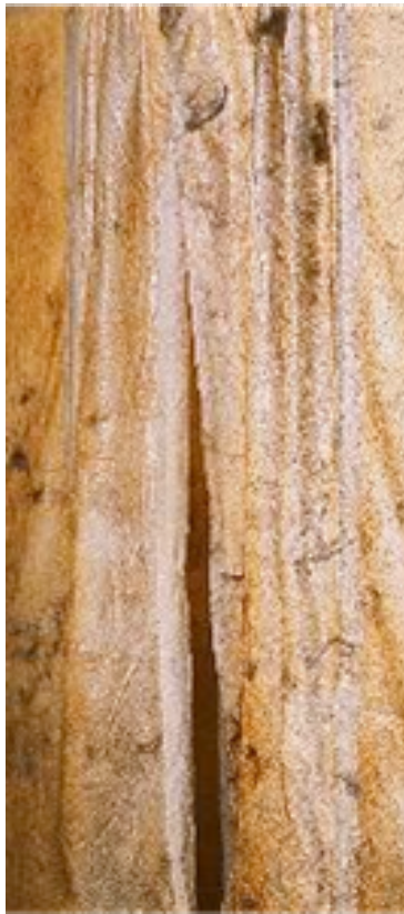
Figure 3. House of Hair (detail)

Through the skin and our sense of touch, we experience the world. In a sexual context, we are often taught to suppress or be shameful of the fantasy or desire to be intimate with another person's skin.