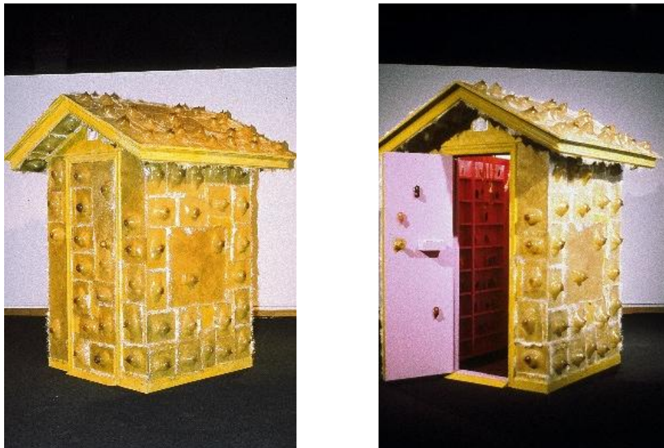
Figure 8. House of Suck

Suckling or feeding from the breast is the infant’s first intimacy with another human. Food can become a fixation to fulfill the want/need of love and nurturing beginning in childhood. In the formative years, the transition between ‘to suck and not to suck’ can be traumatic and sometimes confusing, especially if not handled appropriately by the authority figures within the home.