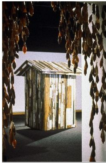
Figure 1. Gallery view of House of Trade

A home is much more than a shelter; it's a world in which a person can create a material environment that embodies what he or she considers significant. In this sense, the home becomes the most powerful sign of the self of the inhabitant that dwells within (123). 1