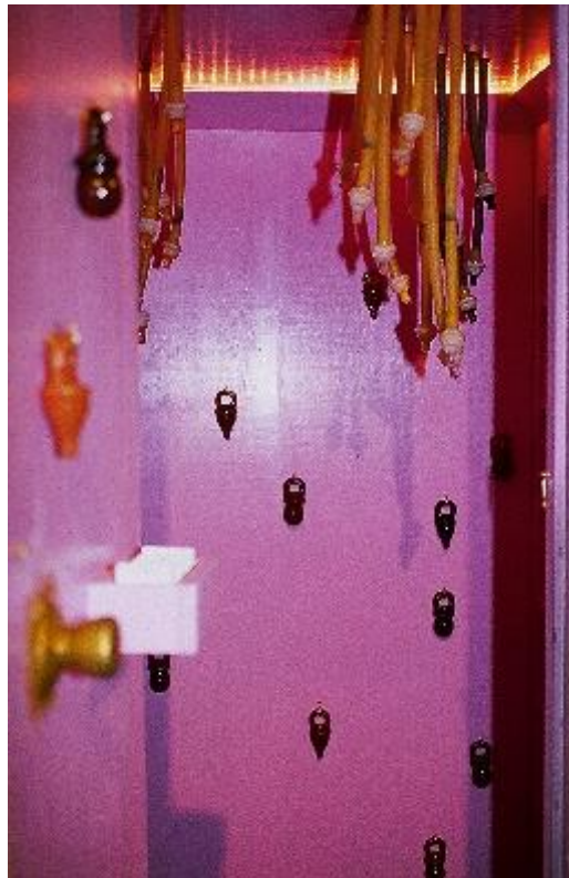
Figure 9. Inside view of the House of Suck

The “House of Suck” visually represents both the conflict and desire to suck. Certain activities, like sucking, are acceptable only in conditions in which mental and social barriers can be overcome. The interior of this structure is glossy and pink, organized like a candy store. The viewers are invited to enter the piece and lock themselves in a private space in which they are able to succumb to their personal fantasies. Nipples hang from the ceiling filled with chocolate, cheese, water, whiskey, and honey. The participants may choose to nurse the nipples and freely take pleasure in their oral fixations. Chocolate lollipops and pacifiers are also available. The exterior is plated with fiberglass breasts. Although they appear soft and supple, the actual texture is hard and sharp. The choice of materials exemplifies the common notion that our natural desires are dangerous and should be repressed.