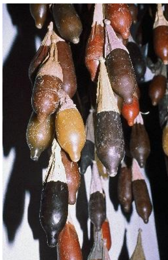
Figure 2. Untitled (detail)

From a social standpoint, much contradiction surrounds the body and its functions. Many physical components and activities are natural ways of exploring the environment through the use of all five senses. The mouth is a sucking, spitting, sensual hole, where taste becomes desire and a focal point of stimulus, feeding the need to understand that which is outside of ourselves. While sucking was once a necessity to sustain life, there is a point at which references to sucking maintain a vulgar, negative (while desirable) connotation to that which remains discussed only in private.