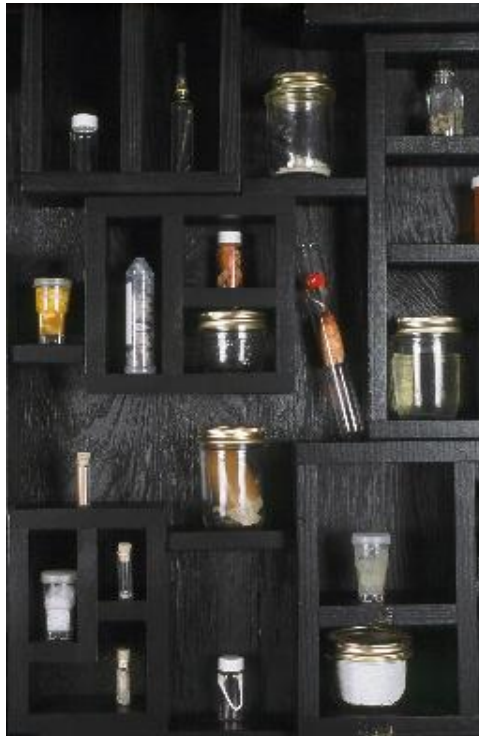
Figure 7. Inside the House of Trade (detail)

In the “House of Trade” the viewer is asked to take something directly from his or her own body and exchange it with something inside a vial or container. The shadow-box walls are black, devoid of memory, and are filled with many cavities containing items relating to my own body. Essentially, it is a give and take, a physical exchange of bodily fluids and excrement with no actual personal contact between me and the viewer. The exterior of the piece is encased in recycled wood collected from demolished houses, which maintains the appearance, and often smell, from which they came. The layers of chipping paint and charred ashes denote the passing of time and imply a visual history. The layering of the wood symbolizes the layering of experiences, which help create each person’s identity and inner sense of self.