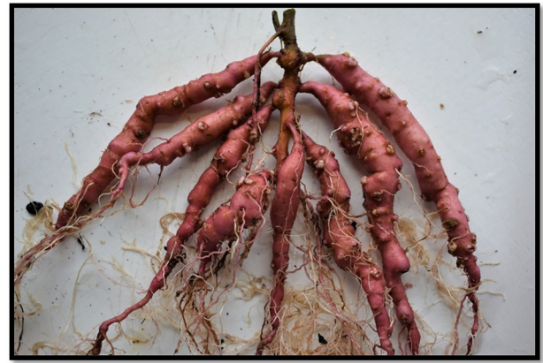
FIGURE 3 Root-knot nematode (RKN, Meloidogyne enterolobii ) infected sweetpotato cultivar Beauregard. In addition to reducing sweetpotato yield, this type of severe galling caused by high populations of RKN in the soil can also render storage roots unmarketable.

Root knot-nematodes (RKNs) affect a wide range of vegetables, row crops, and perennial plants (Nyczepir & Thomas, 2009). Even low levels of RKNs in the soil can reduce crop