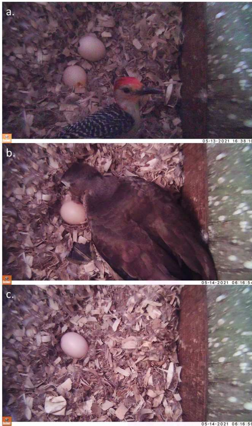
Figure 3. The sequence of events showing the depredation of a wood duck ( Aix sponsa ) egg by a red-bellied woodpecker ( Melanerpes carolinus ) and the removal of the damaged egg during the laying period in Louisiana in 2021. Following egg-laying which occurs at dawn, red-bellied woodpeckers forage on eggs (a) which are then removed by the nest host the next morning (b), reducing the clutch size (c).