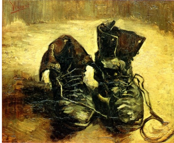
Figure 1, Van Gogh, A Pair of Shoes , (1885) 48

The peasant's world consists of all that is ready-to-hand to her, including her shoes. We can gain access to the peasant's world through Van Gogh's painting. The painting opens up the peasant's world for us: