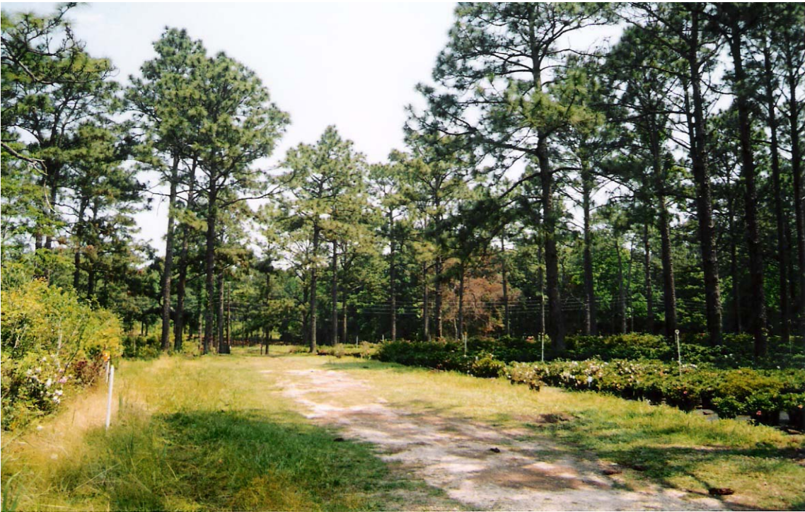
Figure 30. Robin Hill hybrid azaleas ( Rhododendron , Robin Hill)