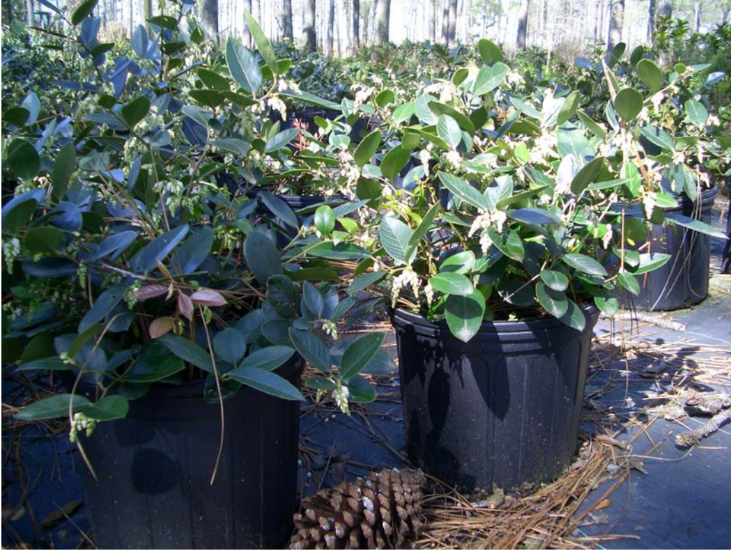
Figure 23. Leucothoe axillaris