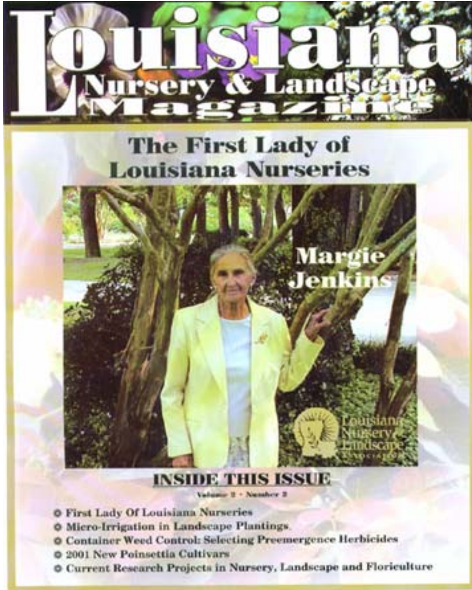
Figure 22. First Lady of Louisiana Nurseries 2000