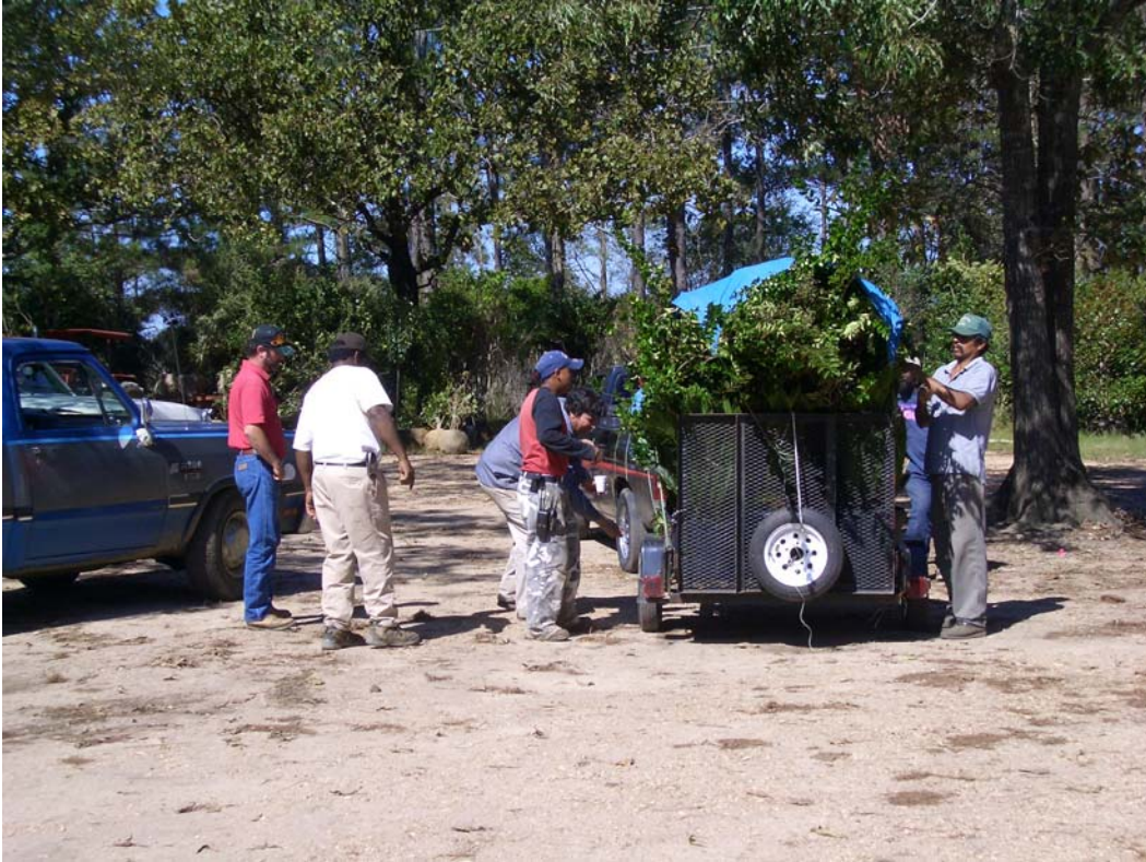
Figure 19. Mark Jenkins loading pickup trucks