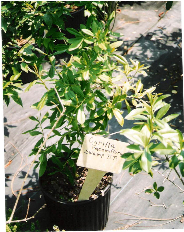
Figure 43. Cyrilla in Jenkins Nursery