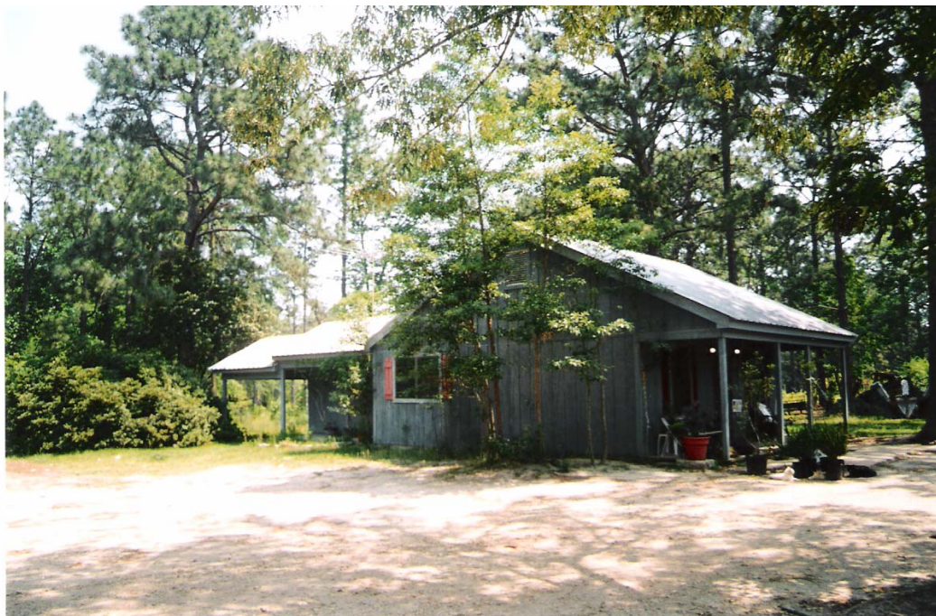
Figure 21. Jenkins Nursery