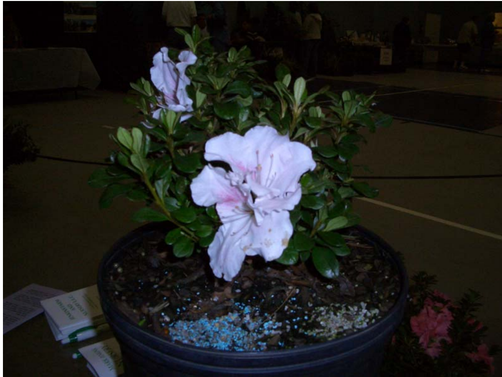
Figure 28. White Watchet azalea named for Jenkins' son Fred 'Freddy' ( Rhododendron , Robin Hill Hybrid Azalea, 'Freddy')