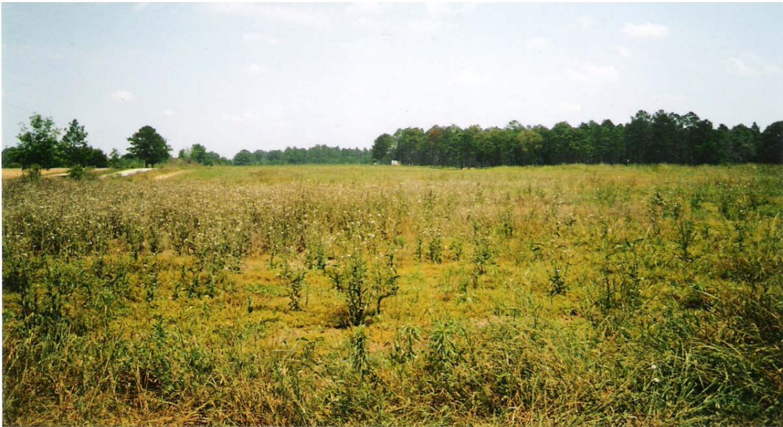
Figure 16. Land where nursery is located at the present time – 2004