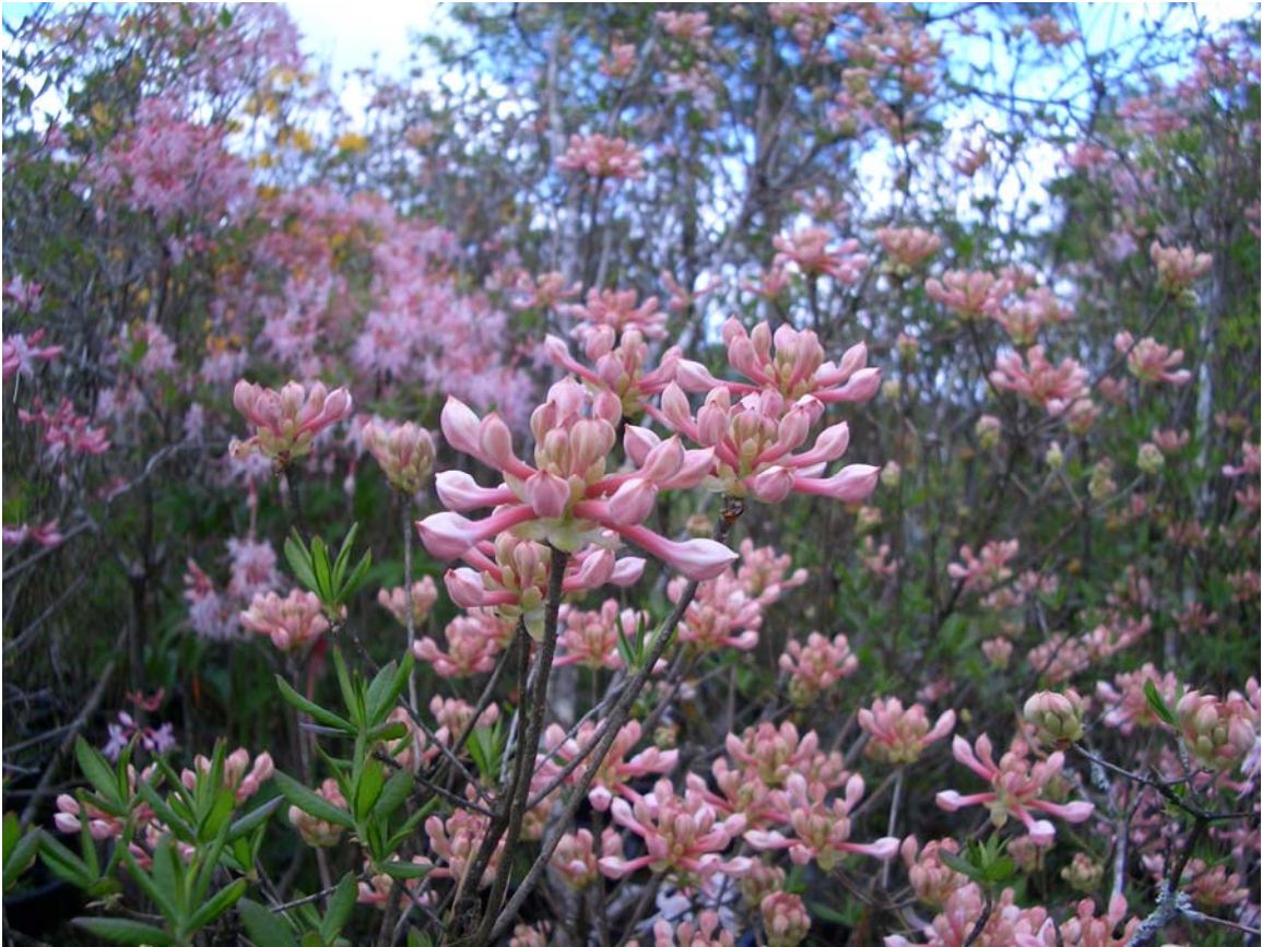
Figure 25. Native azaleas ( Rhododendron canescens )