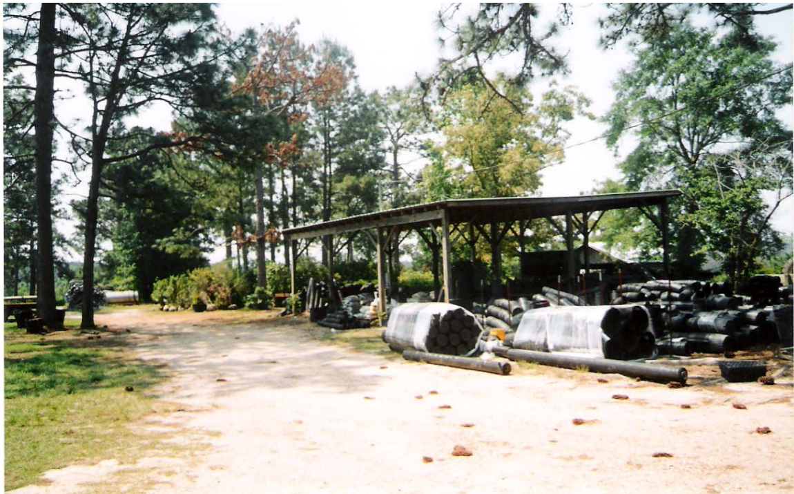
Figure 24. Potting shed, potting machine, and empty pots