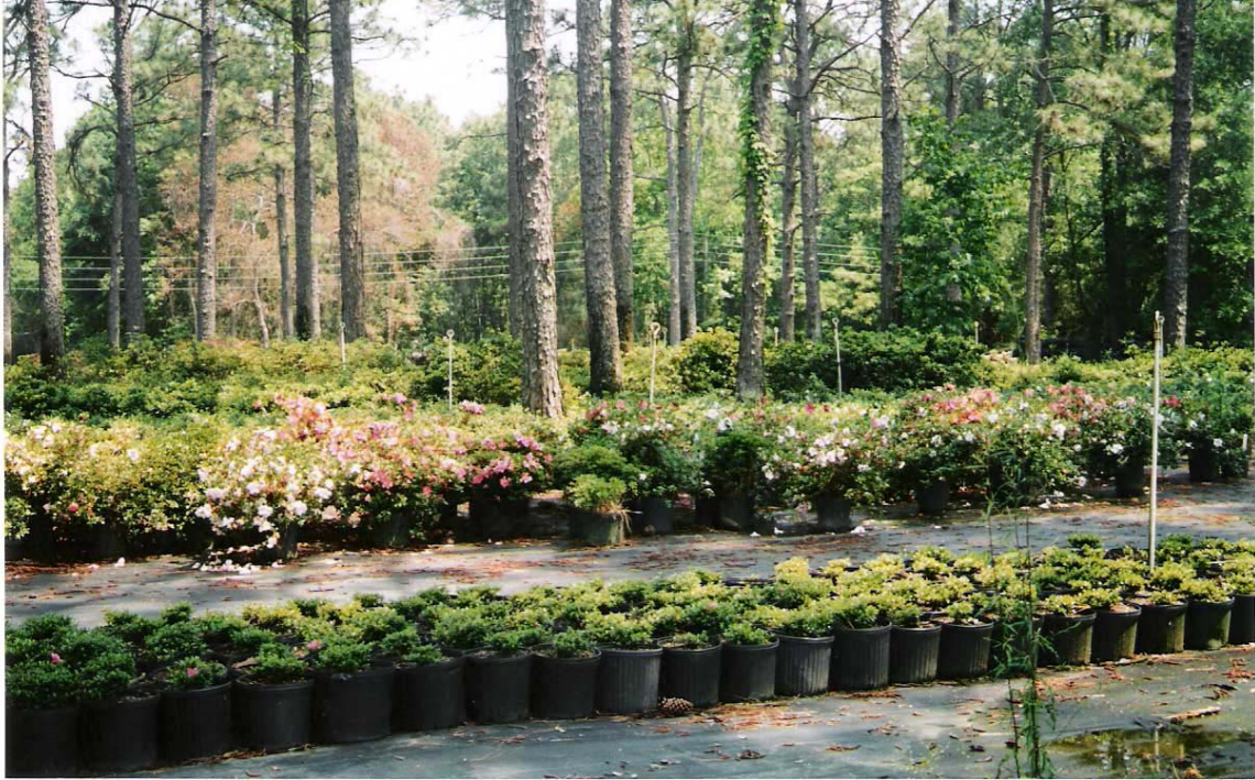
Figure 27. View across container yard - azaleas