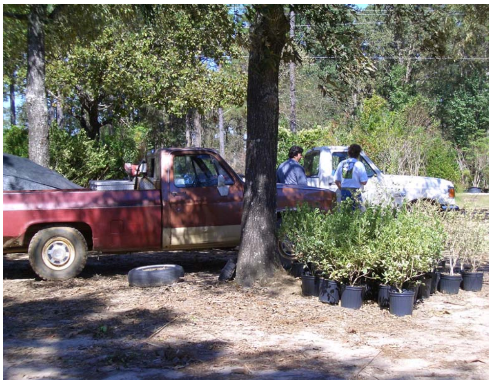
Figure 18. Pickup trucks at Jenkins Nursery