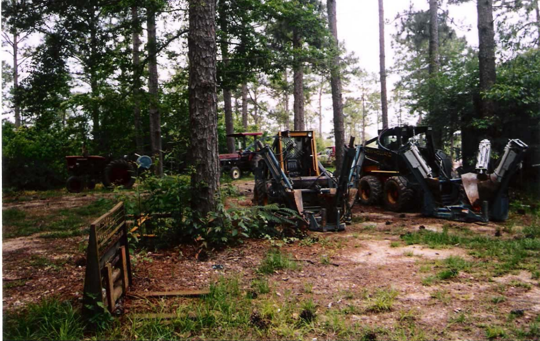
Figure 20. Machinery at the nursery