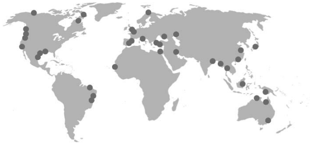
Figure 1. Location of the deltas aged by Stanley and Warne (1994).

determined by coral dating) to identify a SLR tipping point of delta initiation.