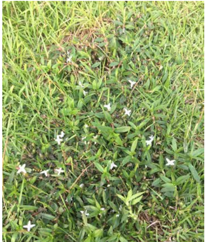
Virginia buttonweed begins flowering in mid-summer.