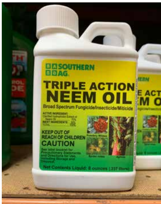
Neem oil is a contact pesticide for insects and fungal disease.