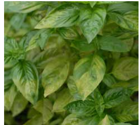
Figure 2. Sweet basil downy mildew.