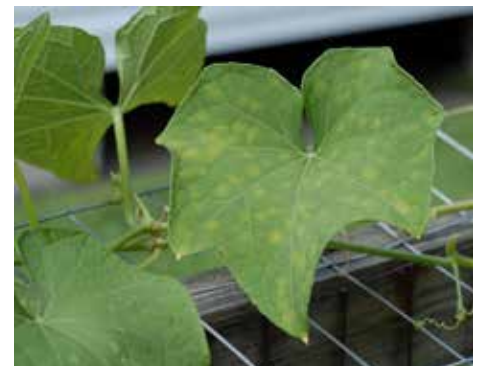
Figure 3. Chayote powdery mildew.