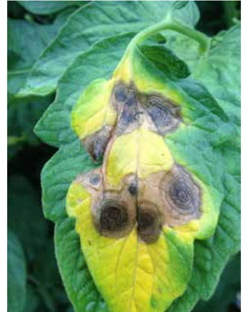
Figure 1. Tomato early blight.

Phytophthora root rot. Root and crown rots commonly affect plants in the home garden, particularly those in poorly drained sites with compacted soils. The first noticeable above-ground symptoms generally include wilting of the leaves, especially during the heat of the day, and stunting of the plants. Additional