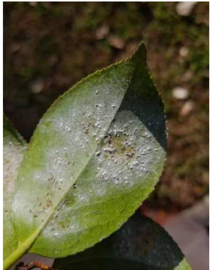
Tiny scale insects can be seen hiding on the underside of the leaves.