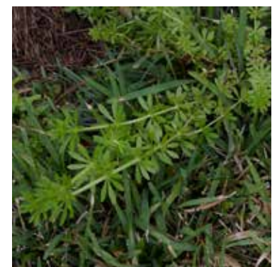
Catchweed bedstraw is a sticky winter weed that attaches to pants and pets.