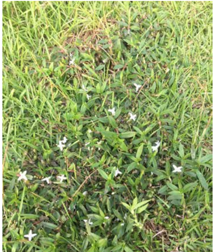
Virginia buttonweed begins flowering in mid-summer.