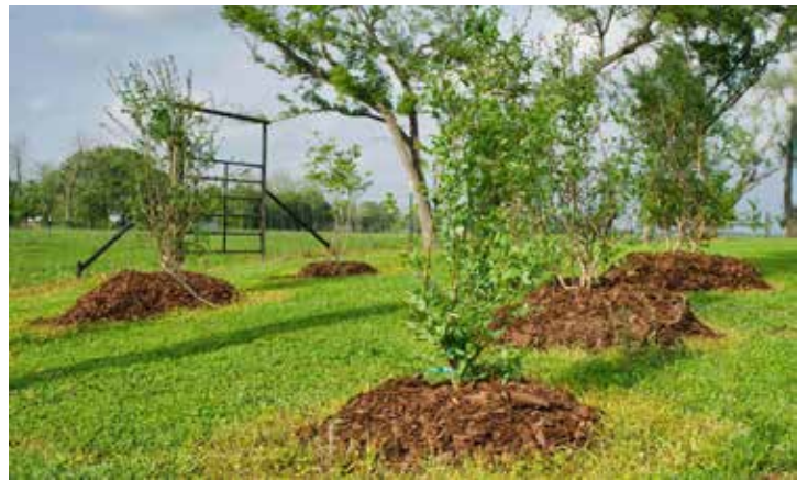
The blueberry mound planting method allows growers to grow blueberries virtually anywhere on the Cajun Prairie. Using soil amendments like pine bark, peat moss and sand will acidify the soil, improve drainage and add needed organic matter for good growth.