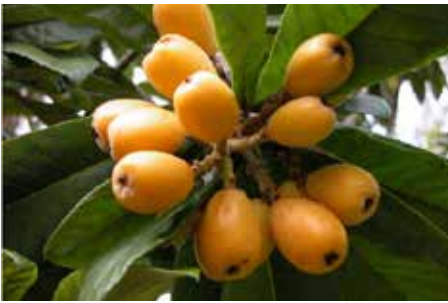
Loquats flower in the fall and fruit matures in the spring.