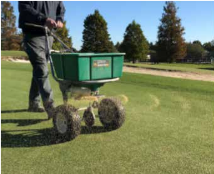
Use a broadcast spreader to evenly apply fertilizer.