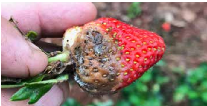
Strawberry fruit rot caused by gray mold and phytophthora brown rot are extremely difficult to control during wet winter conditions. Homeowners should use organic or plastic mulches to keep fruit from meeting bare soil.