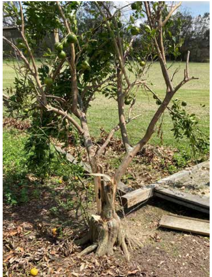
A close evaluation of storm damaged citrus trees should be made by late February. Damaged limbs should be pruned out of the canopy.

Stuart Gauthier, Extension Agent for St. Martin Parish