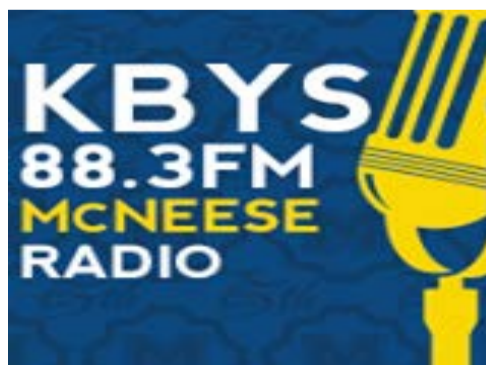
KBYS McNeese Radio Logo.