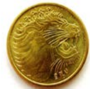
Lions drop coins in dismissal flap.

Advocates for tenure and job stability reached for their snifters of Courvoisier when The Lion's Roar , the vociferously titled campus newspaper of Southeastern Louisiana University, announced that two of the three dismissed professors who had faced dismissal following the shutdown of the SELU French Department had settled their case over their hasty and irregular sacking . Although details of the settlement remained behind drawn curtains, comments by university counsel indicated that the settlement emerged from concerns about the cost of litigation, not to mention the cost of bad publicity such as that which appeared in the national educators' newspaper, The Chronicle of Higher Education . Although the attack on foreign language education in Louisiana public universities shows no sign of abating, it is possible that SELU will learn that the costs for unjustly breaking its agreements with faculty members can be high.