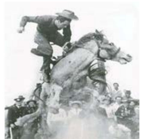
A bright future for Rodeo in Lake Charles.