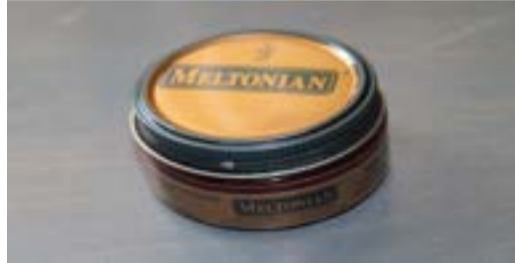
Meltonian Shoe Polish

With the drift toward fitness shoes and other footwear with fabric uppers, shoe shining supplies have become elusive. Bigbox stores and grocery outlets such as Target, Walmart, or Albertsons offer only dumbed-down polishes such as the brush-on version of Kiwi shoe creams. Although its name appeals to animal lovers, Kiwi, even in its original form, is poorly packaged and tends to dry out. The answer for those seeking a starry shine is the Meltonian line of shoe polishes. Meltonian provides almost every color that a shoe fancier might need, from traditional hues such as oxblood and cordovan through standard black and on to an assortment of fashion colors. Better, Meltonian never sits on the shoe like paint on a wall. It enhances the extant color of the shoe and then, like a good butler slipping champagne to guests and then retreating to the pantry, disappears from view. Carefully packaged in glass tubs with airtight screw-on lids, Meltonian shoe care products are usually available only from shoe repair and specialty shoe shops.