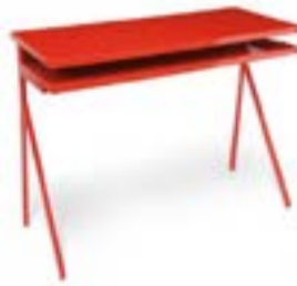
Desk 51 from Blu Dot.

Both bureau and bureaucracy derive from old French words for desks and their coverings. The first stop for any aspiring leader aiming to outfit his or her 300 square feet of space is therefore the desk department. Economy may prompt thrifty Directors to peruse the dungeons of the state surplus shop, but, alas, the heavy, obsolete, and storage-oriented furniture left over from the early days of Louisiana higher education fits poorly with the needs of the electronic information age. Those who are planning to use computational devices and peripherals and who need no drawers or cabinets would do well to look at more modern providers such as Wayfair, Hive Modern, or Blu Dot. Although these design-intensive vendors probe the upper end of pricing and although buying anything costing more than $1,000.00 on a state budget line can lead to hassles with purchasing managers, the aforementioned merchants offer a surprising array of splendid lowcost opportunities. Consider, for example, the brightly colored $700.00 “Desk 51” or the glasstopped “Eurostyle Z” desk. These and many other clean and efficient desk designs not only allow for abundant flexible working space but take the heaviness away from the dark cells in public buildings.