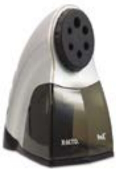
X-Acto leads in pencil sharpener design.

Once the desk is in place, action can begin! The first step toward endorsing an action being the possession of a proper writing implement, pens and pencils are a must. Although connoisseurs in the Newsletter office confess a fondness for fountain pens, the convenience and regularity afforded by a gel writer has driven the bladder and the nib deep into history. Among the numerous competitors for the custom of scribblers, the Pilot Precise V5 pen, with its combination of sharpness, range of color options, and regularity of flow, continues to lead the pen pack. Make sure, however, to read packaging carefully so as to get the original; the thinner and newer V7 version tends to scratch, skip, and run dry. Similarly, not all pencils are alike. Many present inferior, brittle pencil leads of cracking wood. Newsletter teting has revealed the Ticonderoga, billed as “the world’s best pencil,” to be just that. Characterized by moderately soft lead and by wood with an adequate moisture content, the Ticonderoga pencil lasts longer than its competitors and delivers a more sure, dark, and robust line.