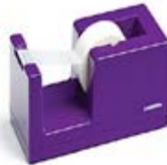
Poppin tape dispenser in purple.

Those who practice professional-level papercutting occasionally make mistakes. Always handy in an office is a good roll of tape and a sturdy tape dispenser. Essential to look for in a good dispenser is a weighted bottom or body and a nonskid base (which, together, prevent the dispenser from sliding when the tape is pulled). For years, tape dispenser enthusiasts have valued discretion, creating low-key designs in neutral colors. Now puckish Poppin has released a veritable rainbow of nicelywaited, contemporary (neoLegostyle) tape dispensers in brilliant, mostly secondary colors such as purple, lime and orange. At the top end at $12.00 list, the Poppin dispensers tape might affix an invoice to your desk as well as a memo to a folder, but they send a signal that an office is aspiring.