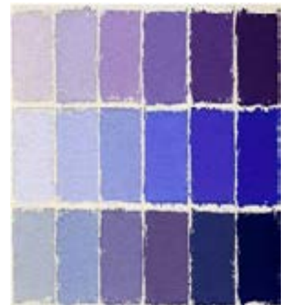
A broadening range of purples in the Tiger administration.