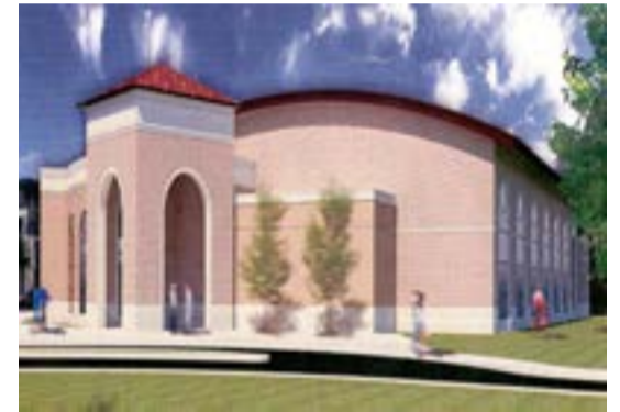
Design for gymnastics practice facility stumbles rather than

In the hundreds if not thousands of pages comprising the minutes of the LSU Board of supervisors meeting, readers eager not only to live but also to pan for gold can always find a few brown nuggets. Those wondering why facilities at Louisiana universities often lag far behind the architectural avantgarde can find the reason in gems of supervisorial of prose such as "the selection of the designer was made by the Tiger Athletic Foundation and the construction company selected will be through a negotiated contract between The Tiger Athletic Foundation and the contractor." Translation: In its quest for a design for the new LSU gymnastics practice facility, the Tiger Athletic Foundation extended its search as far as Government Street, where the reliably mawkish designs of local firm Grace and Hebert were awaiting clients committed to unoriginality and repetition. Looking somewhat like a blend of the budget wing at the Forest Lawn mausoleum and a 1960s Civil Defense bunker, this forthcoming monstrosity offers a case study in the perpetual recycling of the autocracy-inspired architecture of the 1930s. Have none of the LSU Supervisors heard of Norman Foster, Frank Gehry, or Daniel Libeskind?