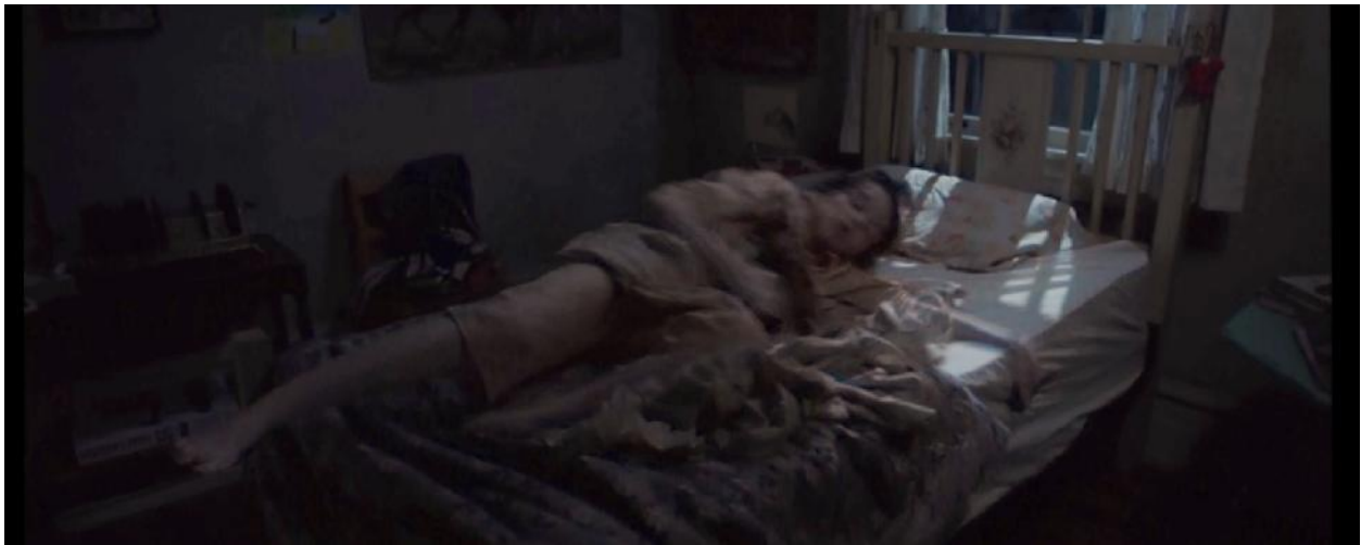
Figure 5.2 Something grabs Christine's leg in The Conjuring (2013).

Wan creatively appropriates a fragment of Paranormal Activity (2009)—Katie being pulled by the leg by the demon—and weaves it into The Conjuring 's narrative.