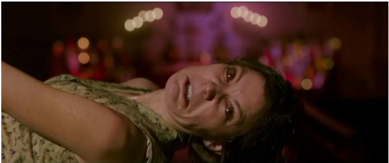
Figure 3.2 “Don’t touch me!” The Exorcism of Emily Rose (2005).

Jason, her boyfriend, approaches her, “Emily?” Emily turns her head. Her pupils are dilated and a deep growling voice says “Don’t touch me!” (see Figure 3.2). Her body collapses. Emily’s normal voice comes through, “Jason, please don’t leave me.”