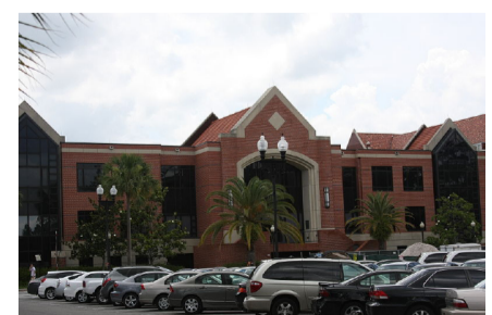
UF Criser Hall—more persuasive than any CV