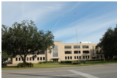
Kaufman Hall, McNeese State

For better or worse, Louisiana abounds in superb examples of the low-budget futurist style practiced by the Works Progress Administration. Although the Newsletter laments the reluctance of state design officials to experiment with new architectural idioms, it is also applauds the respect shown for those building that, despite their lack of modern efficiency, continue to ornament our campuses as they transition into the "historic" category, in some cases even making it onto the National Historic Register. For the last several months, McNeese State University has sedulously renovated its behemoth, WPA-developed Kaufman Hall, the original, core edifice around which the McNeese campus gradually emerged. Then, just as faculty were returning to this heavyweight and increasingly historic pile, a heavy construction vehicle rumbled over and cracked a pipe buried to close to the surface, with the result that the Kaufman basement flooded, doing the predictable damage to electrical and other accoutrements. This artificially induced, quasi-seismic catastrophe has shuttered Kaufman Hall at least until the upcoming semester. Good luck to the "Cowboys" in the restoration of this bulky architectural gem.