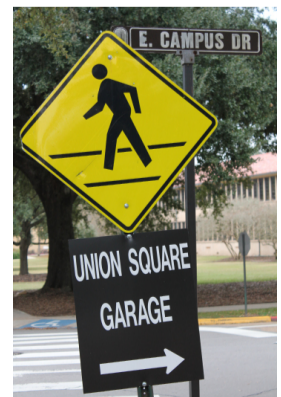
Parkers sit still but parking signs move

More than a few colleagues have noticed that the new parking structure on the LSU A&M campus has been less than overpopulated. In addition to the necessity of estimating parking time and paying in advance, parkers looking at this cavernous edifice have been deterred by safety concerns. But the shortage of parkers may arise from one of the more entertaining gaffs in the history of public structures. It seems that installers have set directional signs too far for the road, with the result that, before finding the parking structure, drivers must first find the information signs. Zeal for the architectural integrity of the campus seems to have worsened the situation as visitors seeking the familiar bright blue "P" sign eventually encounter only dark brown, non-standard signage. There is, however, a happy if costly end to this story. In a move unprecedented since, in Shakespeare's Macbeth , the Birnam Forest walked over to Dunsinane, a new team of experts will relocate the signs to positions in view of the road.