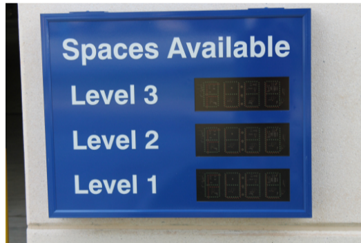
Above: McNeese traffic counter goes tilt