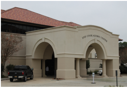
Affordability confab convenes at Cook Center