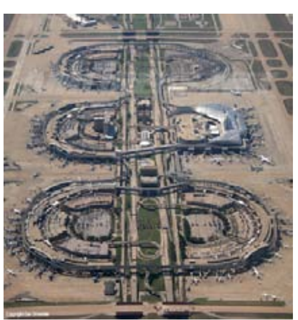
Dallas International Airport

and near-sole tenant, American Airlines. The design of Dallas-two parallel series of colossal semi-circular arcades, somewhat reminiscent of Paris Charles de Gaulle Airport—is appalling, but the sheer immensity of the airport forces the introduction of heterodoxy in the retail and food offerings. Especially commendable is healthy quick-food vendor Ufood Grill, which pumps out a variety of deliciously sauced sandwiches and which seems to be a favorite of pilots and their crews. One serious shortcoming of Dallas is its shallowness. The distance from the security exit to the waiting areas and gates is very short, leaving little room for crowds during peak travel times.