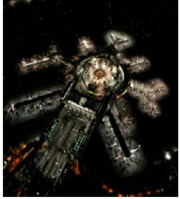
San Fransisco International Airport

It is easy to forget that, although it stands at