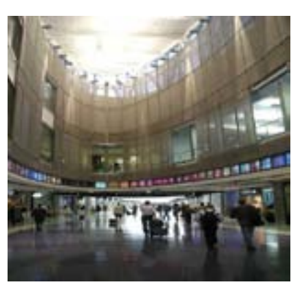
Houston International Airport

Travelers from Louisiana will surely know all too well Houston Intercontinental Airport, formerly a Continental and now a United megahub and number ten on our list. Although "IAH" is surprisingly easy to reach by automobile, being on the north side of the ring road around outer Houston, IAH itself is an unpleasant experience, with clumsy and overcrowded ticketing and check-in spaces, inadequate air conditioning near exits, and loud luggage carousels that suggest the dropping of suitcases by parachute rather than by careful handling. The layout of the secured area is also confusing and disorienting, with no clear relation between the letter-designated terminals and a shortage of maps along the long corridors, walkways, and catwalks. Houston is the first of the airports surveyed to include some truly independent restaurants, a good bet being Bubba's Bayou Grill in Terminal C, but quality of both food and service is unpredictable. The great advantage of IAH for southern travelers is that,