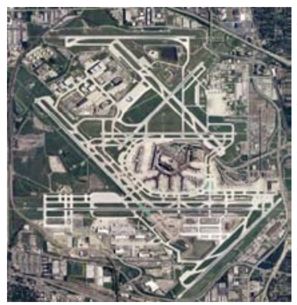
Chicago O'Hare Airport

As the example of Cincinnati shows, an inland hub has some advantages even for over-water travel. Such is the case for Denver, which, despite the rough start occasioned by its maintenance-plagued computerized luggage delivery system, remains one of the cleanest, fastest, most accessible, and most convenient airports in north America. Large pane windows and vast public spaces eliminate terminal claustrophobia. Distributed facilities likewise curtail any food-court or retail-center "feel" and allow the introduction of restaurants that serve at different paces (rather than at the blitzing pace required of the