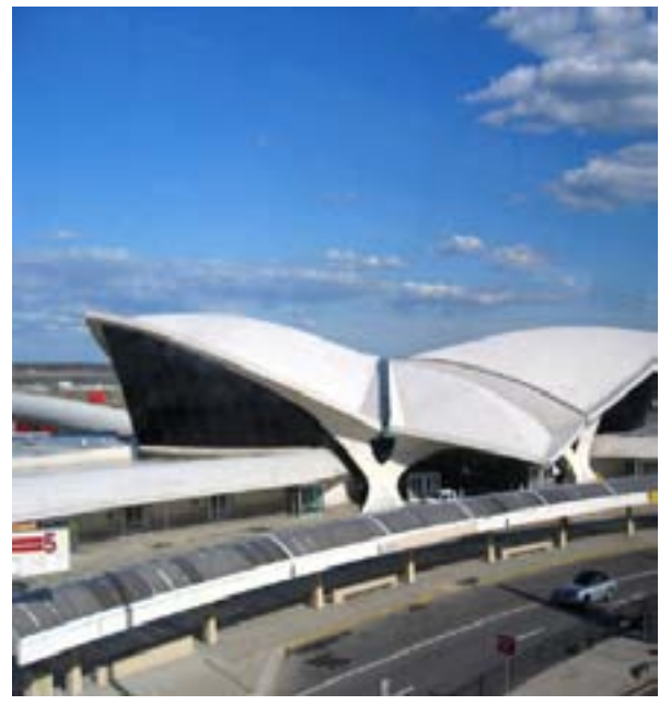
New York JFK Airport