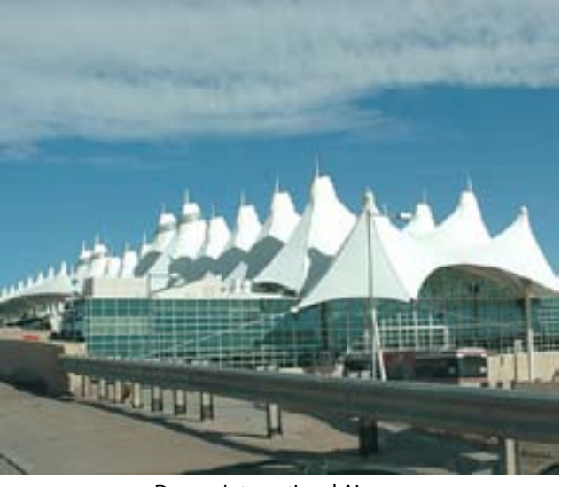
Denver International Airport

terminal intersections). Connections to Hawaii and beyond a easy, nicely scheduled, and not much longer, in travel time, than those leaving from the west coast.