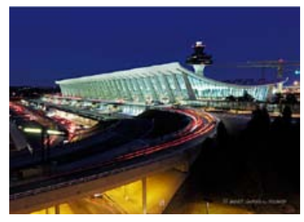
Washington Dulles International Airport

Surprisingly high up in the ranks at position number six is Dallas, which, in recent years, has lost ground in the air derby owing to the economic troubles of its chief