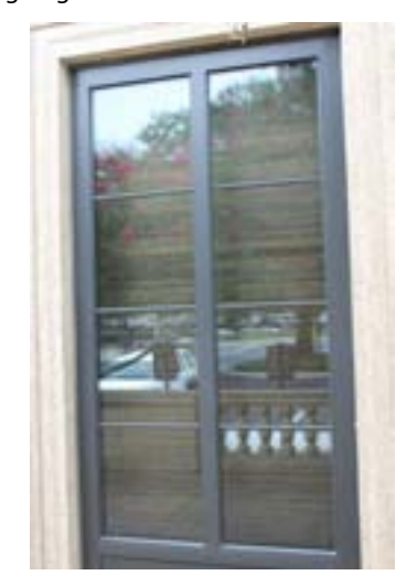
Lockdown at Bill Jenkins's Old Office

In one of the most bizarre episodes to date in the history of the "one LSU" consolidation, the great east wing of LSU's Thomas Boyd Hall, once the LSU Chancellor's office, has been vacated, padlocked, and otherwise immured in mothballs. Window treatments have been drawn; house plants formerly seen in windows have wilted away; and seekers after the campus leadership encounter darkened doors and heavy locks. Optimists speculate that the building, which resembles the Ark of the Covenant, may be headed for conversion into a monument commemorating the days before the outsourcing of leadership; skeptics opine that the building is undergoing decontamination.