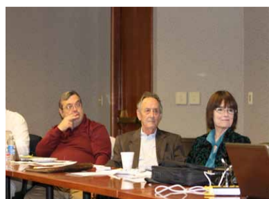
The AAUP Delegation