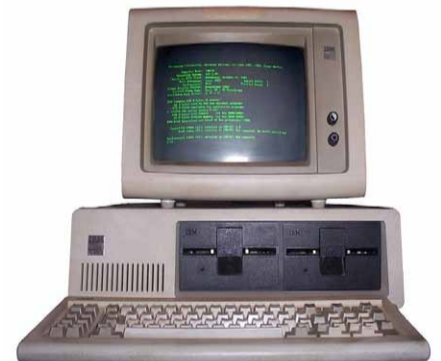
"IBM turns back the clock on salaries"