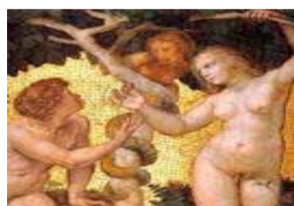
Creationist Superstars Adam and Eve--Part of the Presidential Search