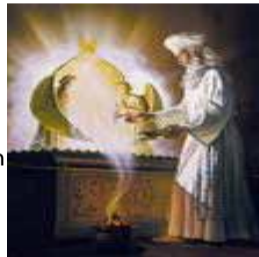
Supervisor Prays--Let the Candidates' Names Go!

Every Saturday, the Baton Rouge newspaper, The Advocate , publishes a spiritual message in a half-page layout at the back of the “religion” section. Sponsored by a group of nineteen business leaders who presumably seek favor from the divinity, the message occupies one-quarter of the advertisement while information about the sponsors occupies more than half the page (at last report, the members of the holy trinity shared space equally, in thirds, but such is not the case in this competition between message and merchant). The Newsletter staff notes that one of these highly visible practitioners of prayer is Manda Fine Meats, the CEO of which serves on the LSU Board of Supervisors. Entitled “Occasions for Prayer,” the April 27th message in this spiritualized advertisement advises readers that “there is never an inappropriate occasion for prayer.” From this, we deduce that the Supervisor in question is busy praying about a thousand matters, indeed is surely joining with the public in praying for release of the names of the presidential candidates that the other, less religious Supervisors have hidden in their Ark of Broken Covenants.