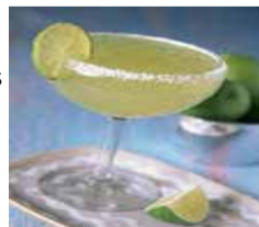
LSU Research Includes Agricultural Products, Silicon Applications