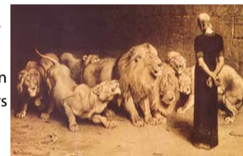
ULM Billboard Points Way to Lion's Den.

Louisiana is a place where ideological controversies images themselves in improbable contexts. One such venue is the environs of Egan, Louisiana, along Interstate 10, between exits 72 and 76. In what might be called the five-mile "Strip Strip," two adult book and video stores (including the tiger-rival "Lion's Den") vie for attention with an evangelical oil industry, Francis Drilling Fluids, which bedecks the ribbon of highway with a gigantic red lighted marquee that flashes non-stop moral and religious messages 24/7. Way back in the spring of 2011, this controverted road segment also hosted numerous billboards proclaiming the end of the world on 21 May 2011, per the prophesies of Reverend Harold Camping. Now a new billboard has popped up in this high-gain proclamation zone. The billboard announces the high-quality education and scintillating lifestyle available at the University of Louisiana in Monroe, which, indeed, has produced some of the finest faculty activists in Louisiana. A somewhat scratchy font suggests that the educational experience in Monroe will combine the ambience of an Oak Alley with the energy of a lightning bolt.