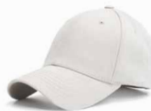
Not Every White Cap Goes with the Good Guy.

As Louisiana's leading football team heads to a bowl game sponsored by one chicken sandwich chain under the guidance of a coach who promotes a rival chicken vendor and while sums equal to bowl earnings are spent in the subsidy of on-campus wellness programs that counteract bad diets, questions are bound to arise about the propriety of universities participating in events sponsored by firms that collaborate in the plumping and softening of American youth. Those tickled by the "Fear the Hat" campaign that presents LSU's football coach as a powerful icon of something-or-other might want to look at the nutrition data on Cane's chicken , which disclose that those spicy fingers conceal a whopping 42% fat content—hardly a training-table item. By comparison, Chick-fil-A scores a 25% fat rating but nevertheless earns a D+ for overall nutritional efficacy. Evidence against hypocrisy will be in short supply until football officials affirm that they feed their players a diet of the sort that, at a handsome fee, they endorse for the cheering public.