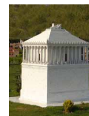
Scale Model Mausoleum at Helicarnassus