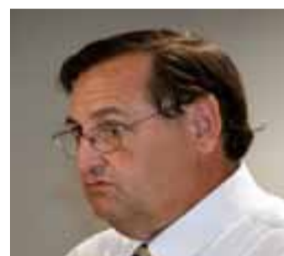
A G Monaco

Those two factors are of great importance in higher education because it allows for faculty in particular to be recruited from both private and public universities and allows immediate vesting to those concerned about attaining tenure. While LASERS most recently has been confined to covering classified (civil service) employees on our campuses there are still non-classified professionals and some faculty that are members of LASERS. (continued on page 8)