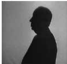
Hitchcock's Famous Silhouette: Icon of Dark Doings