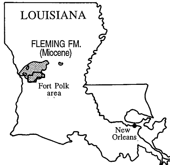
Figure 1. Location of Fort Polk and outcrops of the Fleming Formation in Louisiana. Modified from Jones et al. (1995).

and a merychippine horse. Lower vertebrate material includes gar, catfish, alligator, snake, and lizard remains.