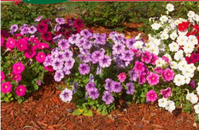
A fresh layer of mulch will protect these petunias all winter.