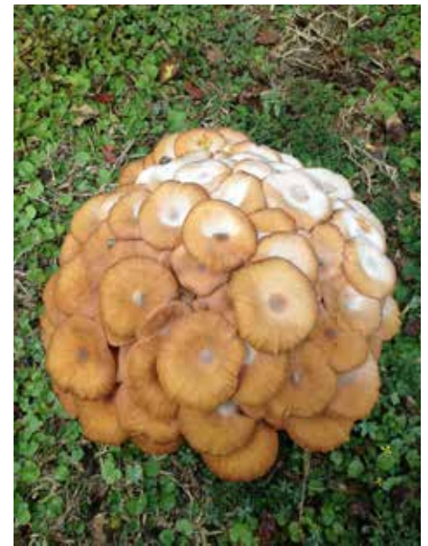
Cluster of honey-colored mushrooms produced by Armillaria sp.