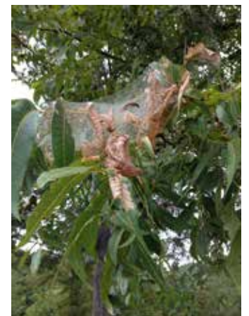
Webworms can quickly defoliate a pecan tree, causing unsightly damage.