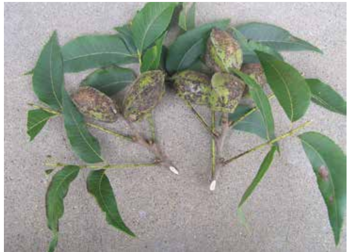
Pecan scab on nuts