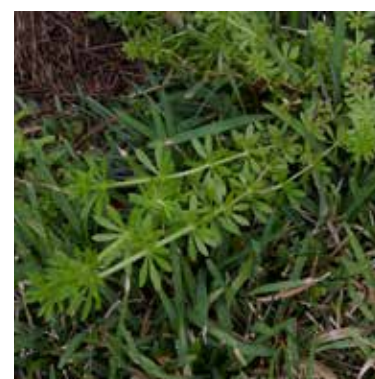
Catchweed bedstraw is a sticky winter weed that attaches to pants and pets.