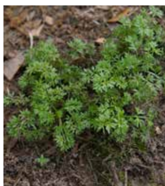
Lawn burweed germinates in the fall and produces painful stickers in the spring.