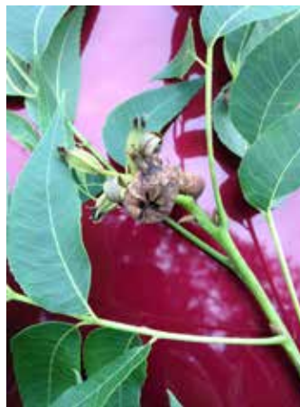
Pecan phylloxera is a gall-forming small aphid-like insect. Symptoms appear in spring.