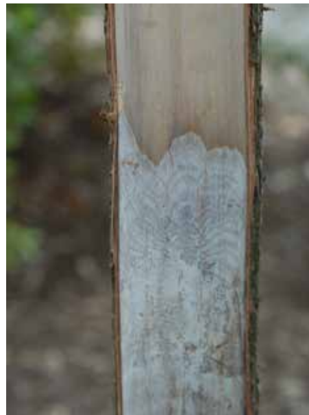
Bottle brush showing white fungal mycelium extended 2 feet up on the trunk.