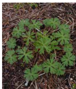
Wild geranium is a common winter broadleaf infesting lawns.