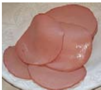
The Next Search: Dean of Bologna

Academe has a big role to play in upscaling the cultured food chain. Almost all the blunders that the Newsletter detected result from lack of education, lack of international or intercultural experience, or just plain lack of this, that, or the other thing that education should supply. Before we set the goals of Louisiana higher education too high, perhaps we need a Dean of Bologna to ensure the congruency of our needs with the curriculum of the shelves.