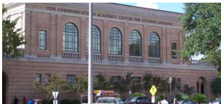
The Cox Center