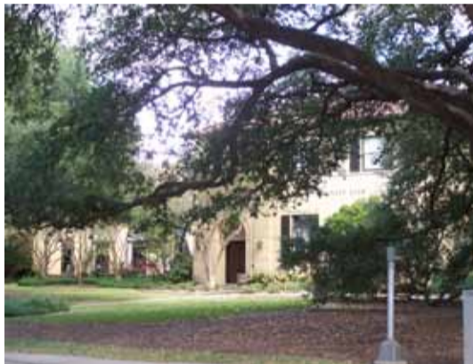
LSU Faculty Club

2. The Renovated Music and Dramatic Arts Building --- including the Shaver Theater. All over the LSU campus, there is still the architectural memory of the totalitarianism of the 1930s and 1940s. The conquest and conversion of that legacy, including its 10% admixture of toxicity, is no small challenge. The design team that reworked the "M&DA" building seems to have overcome history to create a palace of future delight. The idea of piping music into the restrooms during performance evenings—a Larry Kaptain exclusive?—is a genuine stroke of genius that creates an elegant steakhouse or pre-theater ambiance. This oasis in an architectural desert leaves all visitors feeling happy and hopeful, especially after having frolicked in the ruby-slipper-land of the Shaver Theater.