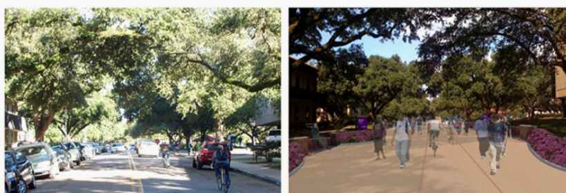
Tower Drive, Before and After Easy Streets II